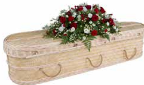
The BAMBOO WOVEN by Naturally Woven