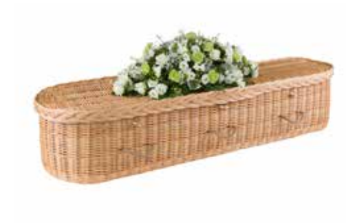
The WILLOW by Naturally Woven