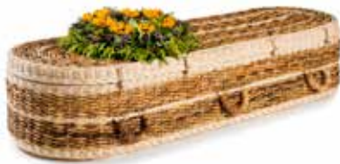
The BANANA Round by Eco COffins