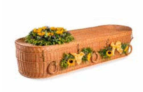
The CROMER Willow by Eco Coffins