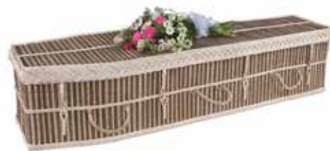
The COCOSTICK by Naturally Woven