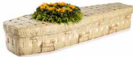
The BAMBOO LATTICE by Eco Coffins