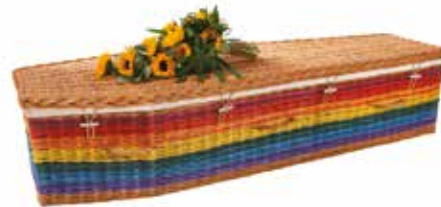
The SOMERSET RAINBOW by Somerset Willow