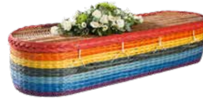
ENGLISH WILLOW RAINBOW by Eco Coffins