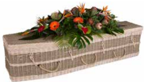
The SEAGRASS by Naturally Woven