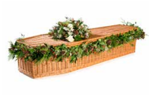
The HIGHSTED Willow by Eco Coffins