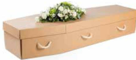
The CARDBOARD by Eco Coffins