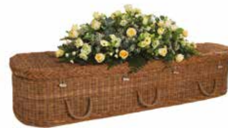
The WICKER by Naturally Woven