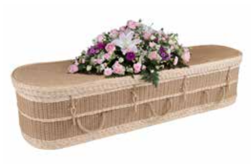
The LOOM by Naturally Woven