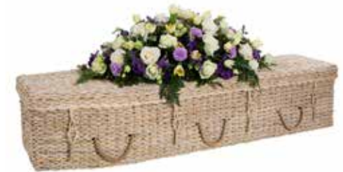
The BANANA LEAF by Naturally Woven