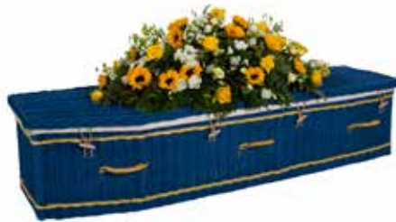
The SOMERSET COLOURS by Somerset Willow