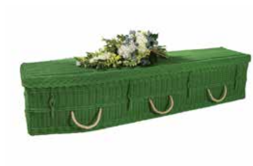
The COLOURS by Naturally Woven