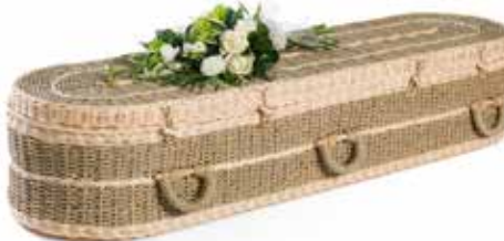
The PANDANUS by Eco Coffins