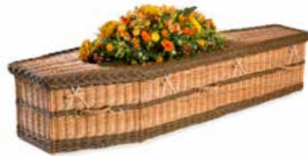
ENGLISH WILLOW by Eco Coffins