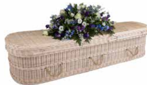
The CANE by Naturally Woven