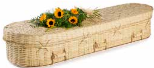
The BAMBOO ECO by Eco Coffins