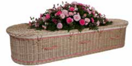
The SOMERSET WILLOW by Somerset Willow