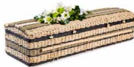
The BANANA Casket by Eco Coffins