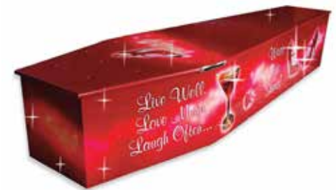
The SOMERSET COLOURS by Somerset Willow